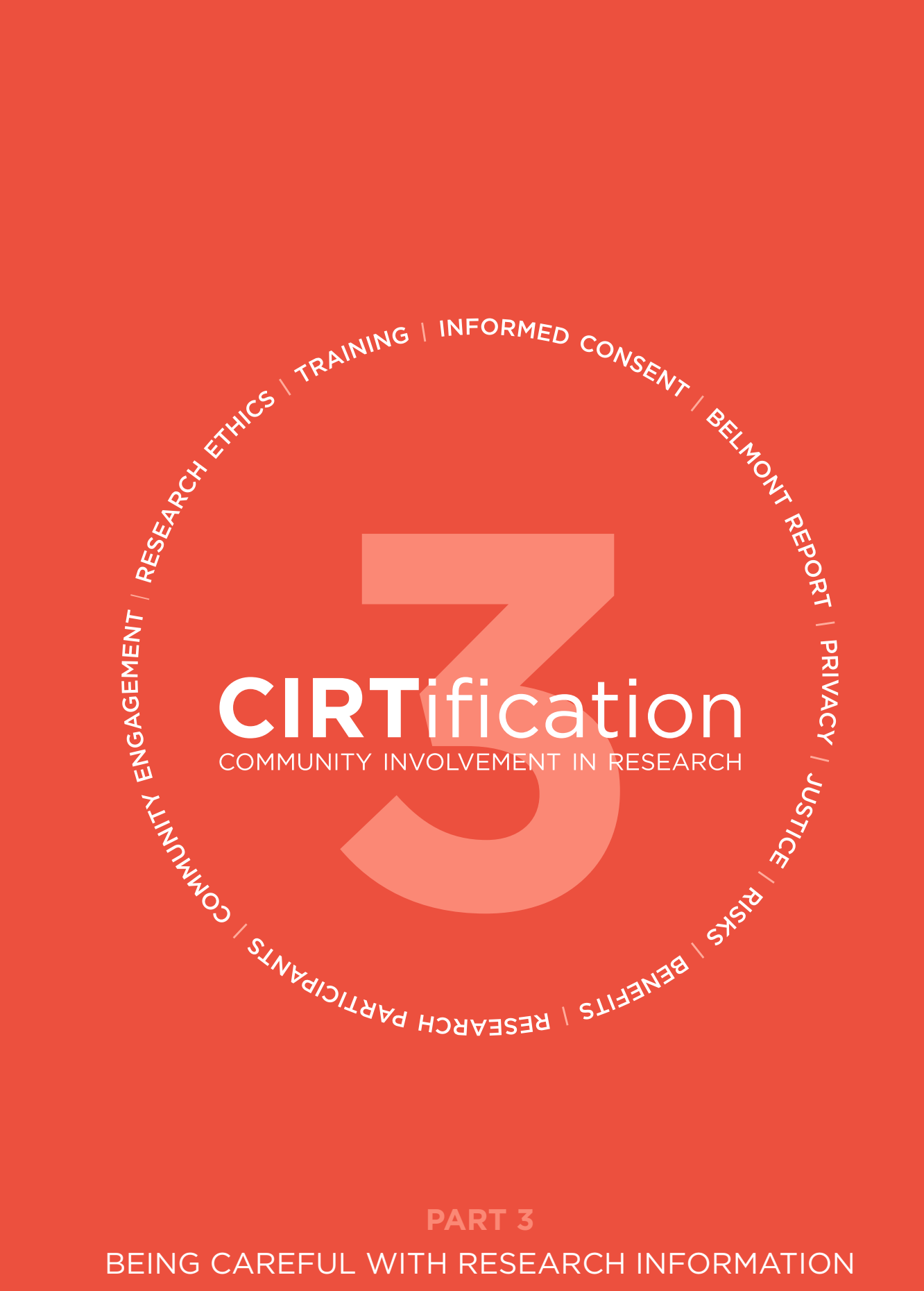
BEING CAREFUL WITH RESEARCH INFORMATION